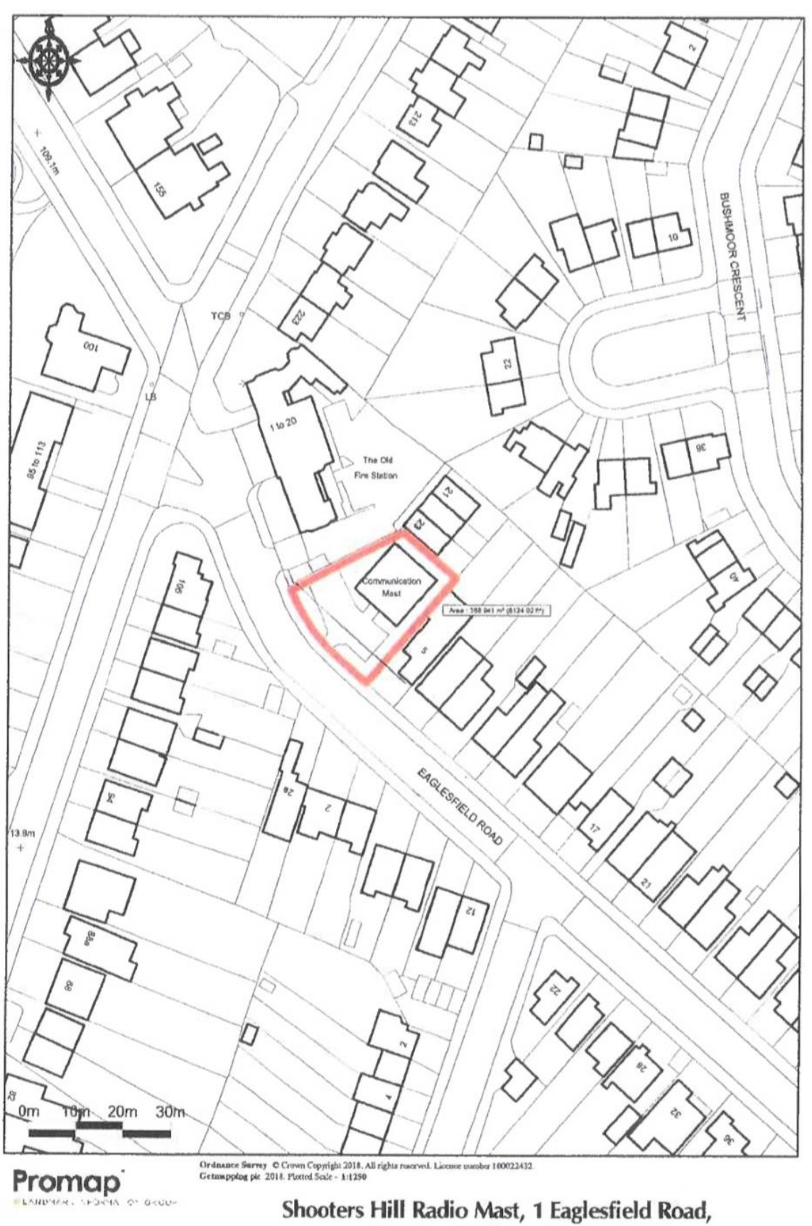
Appendix 1: Ordinance Survey Map of proposed disposal location (outlined in red)