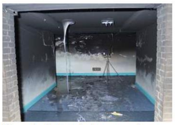
View going in through the communal entrance. Note light fittings have melted