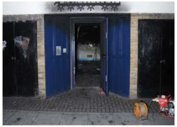
View of front communal entrance

4.27 The following example involved a small motor scooter in a communal area. What is notable is the extensive damage not only from smoke, but also from the heat. There was apparently relatively little petrol in the scooter; the majority of the fuel loading was from the plastic body panelling.