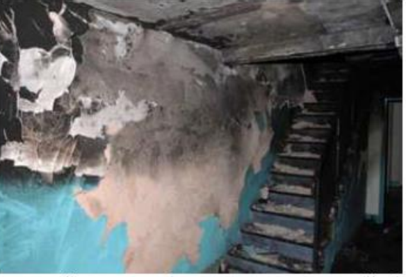
Stairwell opposite the scooter. Note; spalled plaster from the stairwell has fallen onto the stairs