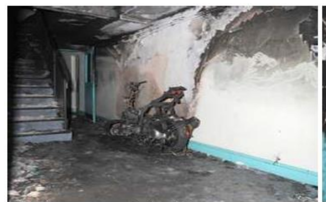
Clear burn pattern behind the scooter, Note rear tyre is still intact