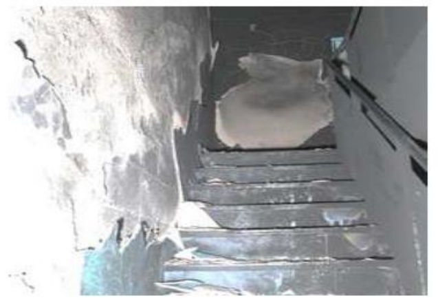
Image to left: View upstairs showing extensive heat and smoke damage.